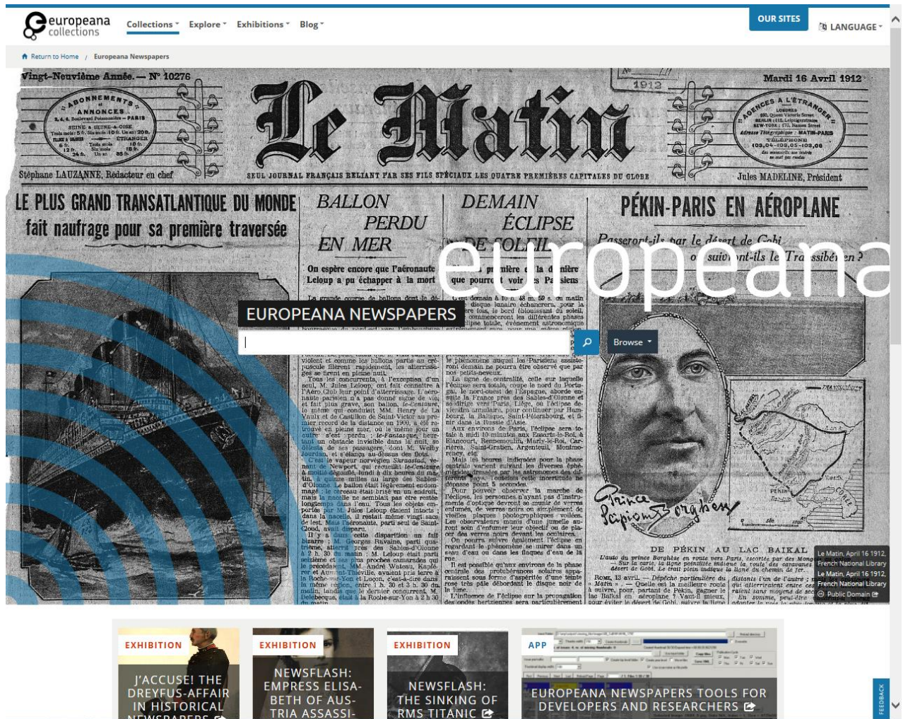
Mockup for the Europeana Newspapers thematic collection landing page